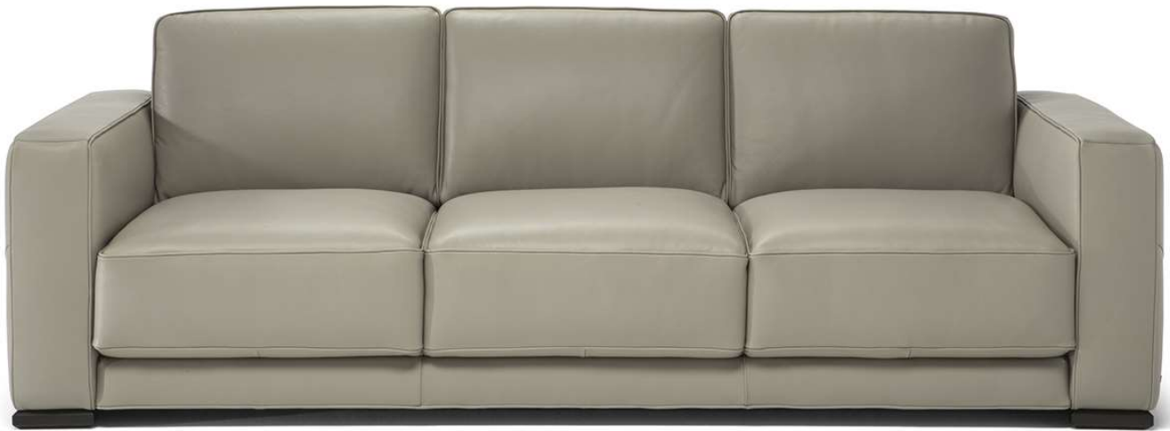
■ Vers. 064