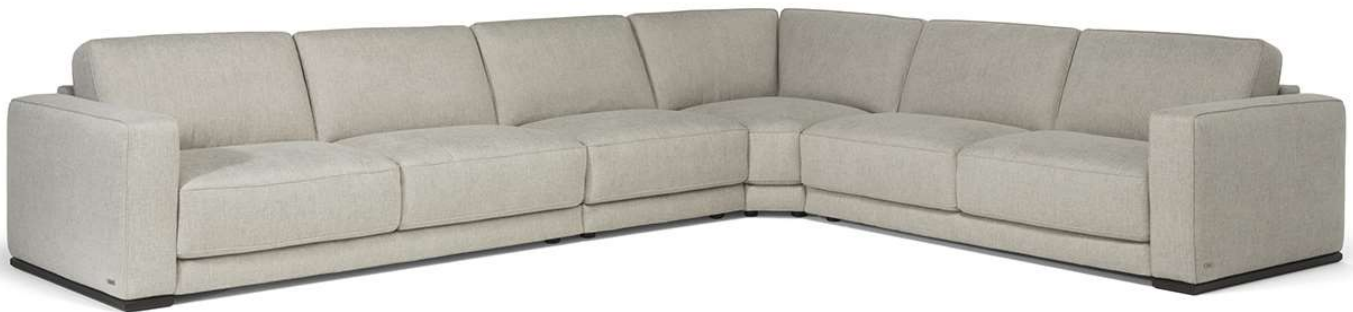
■ Vers. 216+291+011+217