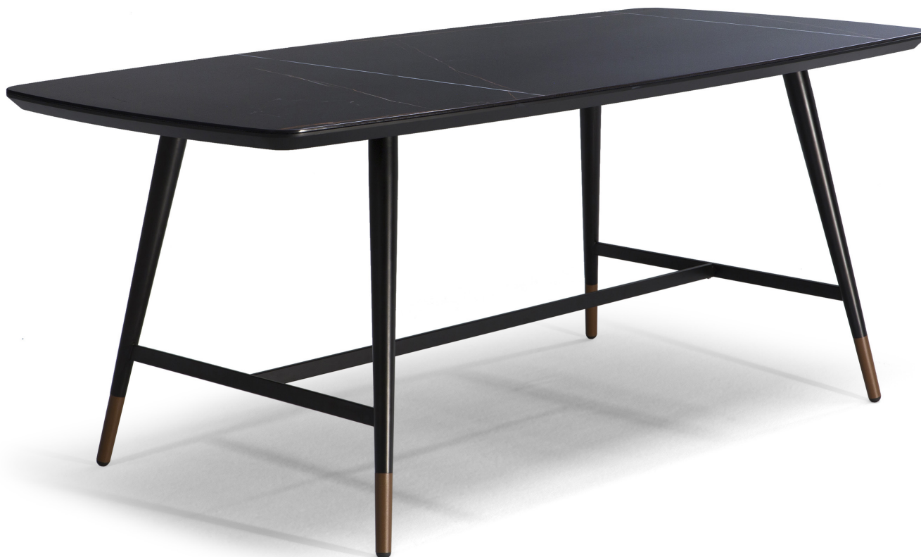
■ T22605X / T22611X